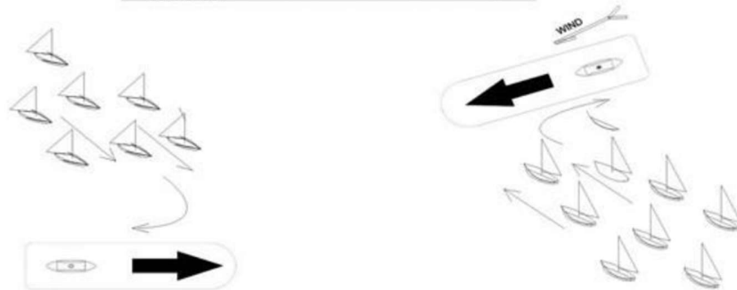
SHIP & FERRY ACTIVATED EXCLUSION ZONE